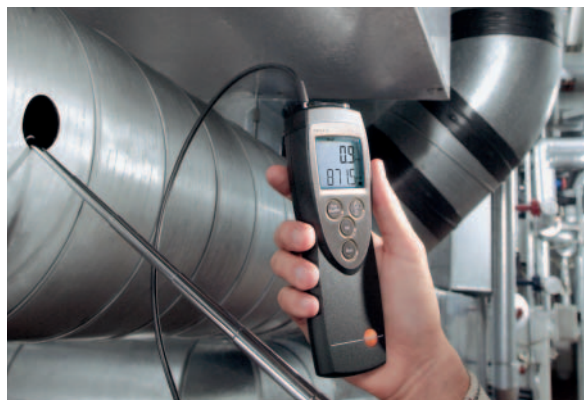
testo 425, e.g. for monitoring the volume flow of the exhaust air