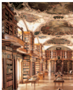
Museums, art galleries

The HygroPalm2-series (with integrated or interchangeable probes) is ideal for all applications where exact measurement of humidity and temperature is of decisive importance, e.g. the food and pharmaceutical industries, printing and paper industries, many trades, the sciences, meteorology, agricultural sector, climatology, etc. There is hardly a field today in which these parameters may be ignored. It is ultimately the measuring task at hand that defines the HygroPalm instrument that best meets your needs.