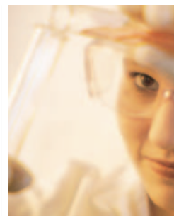
Healthcare, the sciences