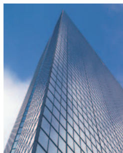
HVAC / Building management