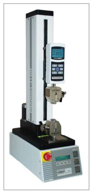
Shown with an ESM301 test stand and G1061 wedge grips

An ergonomic, reversible aluminum design allows for hand held use or test stand mounting for more sophisticated testing requirements. Series 4 digital force gauges are directly compatible with Mark-10 test stands, grips, and software.